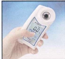
② Press the START key.