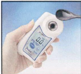
① Place the sample onto the prism surface.