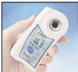
③ The measurement value will be displayed in 3 seconds.