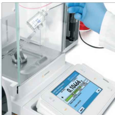
Step 1: Weighing of the compound