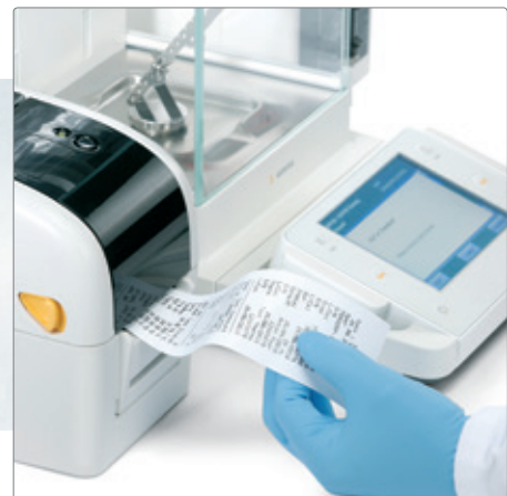
Step 5: Print the results in GLP or label form on self-adhesive paper