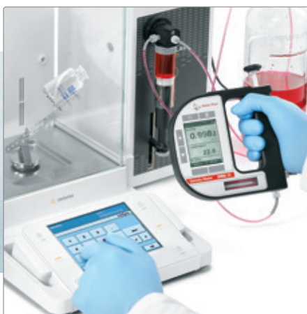
Step 2: Measure the density of solvents