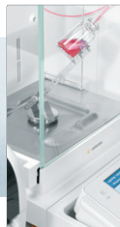
Step 3: Dispense the exact