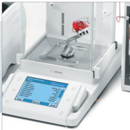
Step 4: Check the achieved results gravimetrically