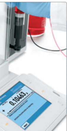
amount of solvent